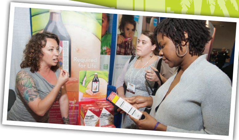
Exhibit Hall and Midwifery Market Open with Lunch Served